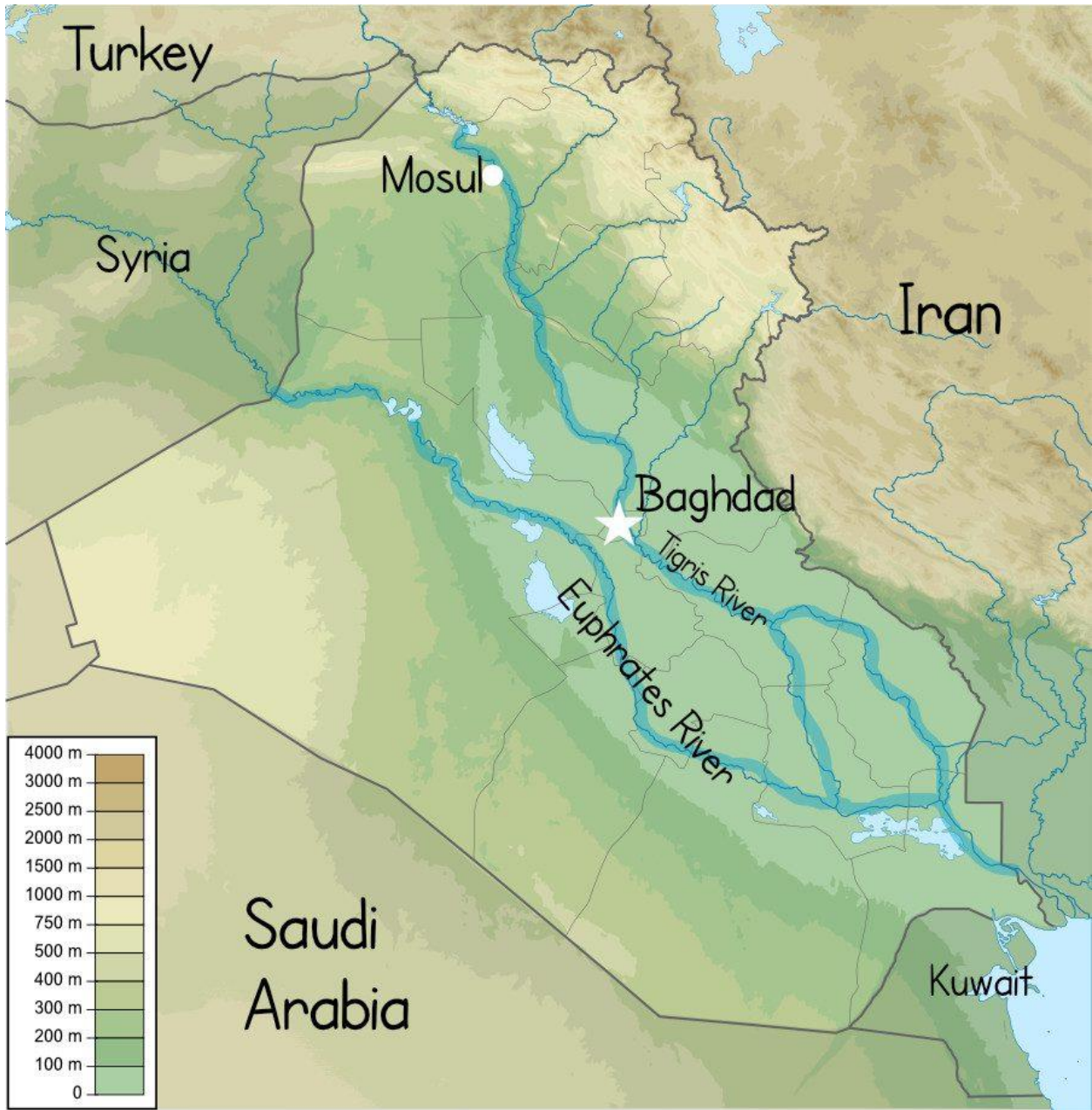
Elevation map of Iraq 2